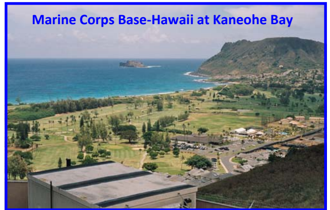
Marine Corps Base-Hawaii at Kaneohe Bay