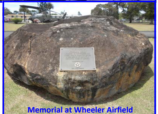
Memorial at Wheeler Airfield