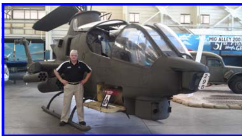
A6M Zero & F4F-

Wildcat the PAM has Cold War aircraft like the AH-1 Cobra, MiG-15, F-15 Eagle & F-14 Tomcat plus many more.