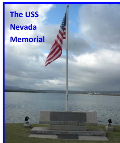
The USS Nevada Memorial

During the MHT tours we try to get people to the sites they need to see as on the 70th Anniversary we had a relative on the USS Nevada (BB-36), the only battleship to get underway during the attack. We visited the USS Nevada Memorial at Nevada Point where the battleship was run aground to make sure it didn’t sink in the channel. It is also worth a stop at Wheeler Field that was a prime target of the Japanese due to the Army Air Corps fighter aircraft near Schofield Barracks where there is a large static display of weapons & aircraft as well as the memorial rock.