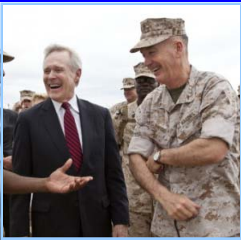
LEFT: COMMANDANT "JOE" DUNFORD WITH SECNAV "RAY" MABUS AT THE 70TH "REUNION OF HON- OR" CEREMONY. RIGHT: COMMANDANT "JIM" CONWAY