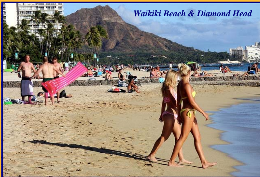
Waikiki Beach & Diamond Head

OPTION: Add 1 to 7 additional days in Honolulu to see the sights or enjoy the beaches on your own. Call the office for details.