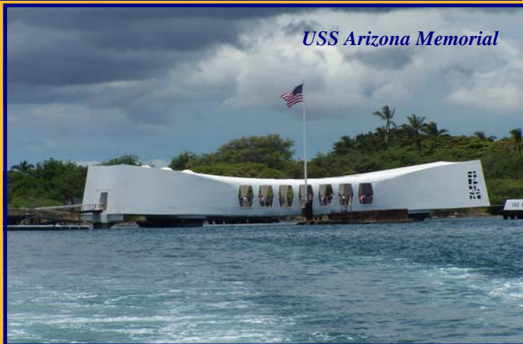
USS Arizona Memorial

28 March - After breakfast, we head for the "Punchbowl", the National Cemetery of the Pacific. From there we head to Ford Island to have lunch and visit the Pacific Aviation Museum. (B/L)