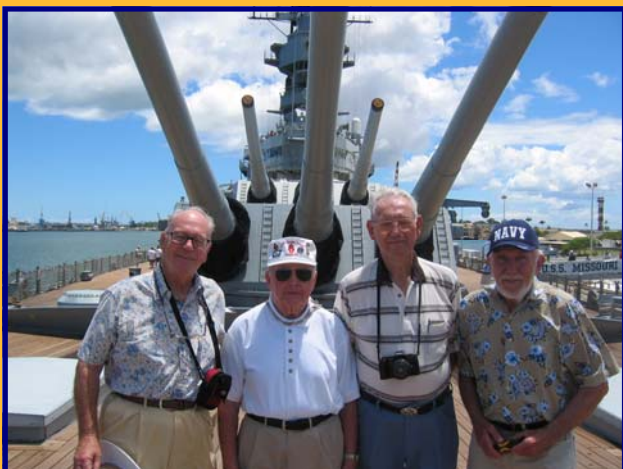
Veterans on the Battleship USS Missouri

27 March - After breakfast we depart for the Arizona Memorial. While there we also visit the USS Bowfin and the Submarine Museum. After lunch we tour the USS Missouri and Ford Island. (B/L)