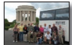
Great Great War Tour

Belleau Wood - Chateau Thierry - Meuse-Argonne - Verdun