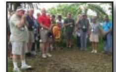
Remembering the Fallen

Soc Trang - An Loc - Tay Ninh - Bien Hoa - An Khe - Pleiku