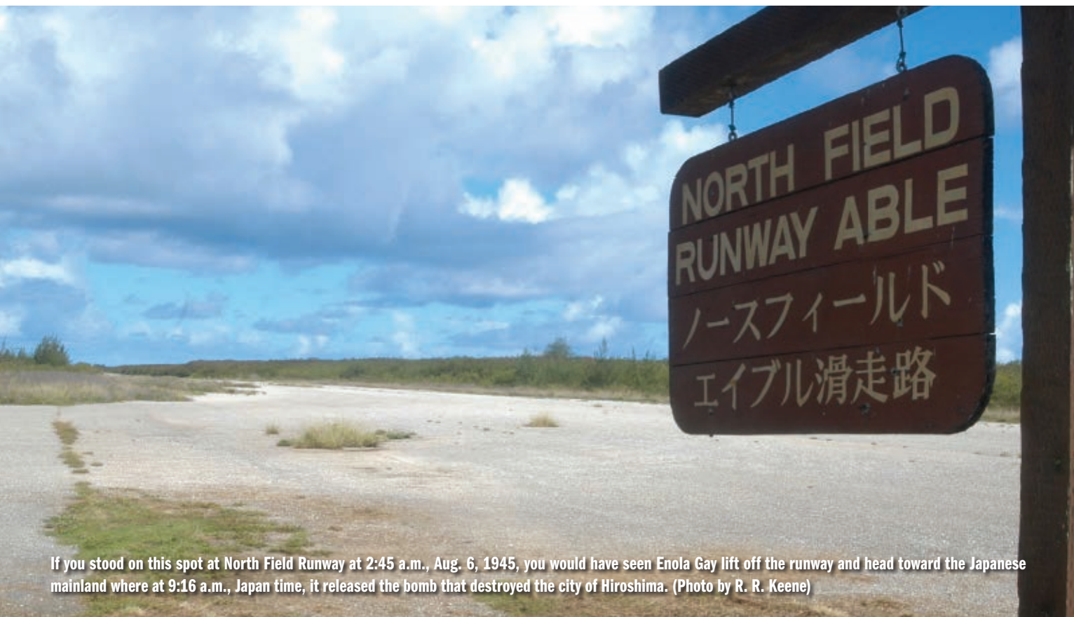
If you stood on this spot at North Field Runway at 2:45 a.m., Aug. 6, 1945, you would have seen Enola Gay lift off the runway and head toward the Japanese mainland where at 9:16 a.m., Japan time, it released the bomb that destroyed the city of Hiroshima.