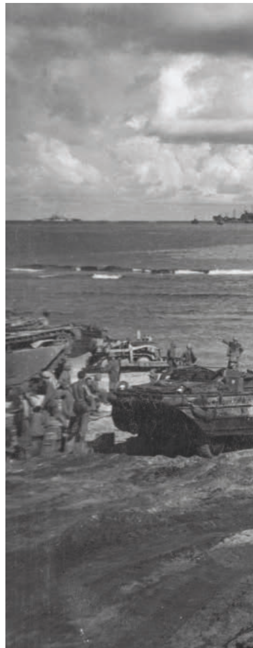
Visitors with Military Historical Tours (above) walk the same beaches at Tinian in July 2011 where the 4thMarDiv (right) came ashore on July 24, 1944, navigating through submerged mines and initially intense, but overall light resistance.