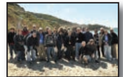
Gallipoli Landing Beach

ANZAC Day Ceremonies - the best way to see Turkey