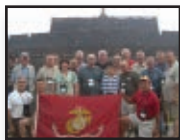
Tet Offensive & Hue City