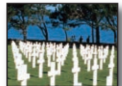
Crosses at Normandy Beach

Moscow - Smolensk - Re-enactment of the Battle of Borodino