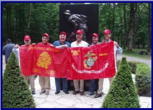
General “Mike” Hagee, USMC 33rd CMC with Marines at Belleau Wood Iron Mike Memorial.

After breakfast, embark on a half-day tour of this beautiful city and take in its most remarkable sights, including the iconic Eiffel Tower. Continue past the École Militaire, Orsay Museum and Latin Quarter. See the Cathedral of