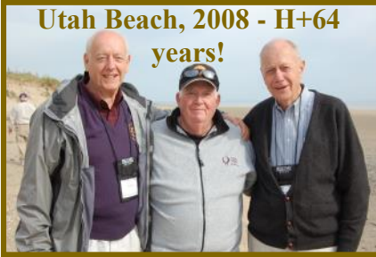
Utah Beach, 2008 - H+64 years!