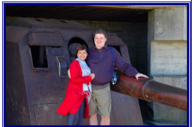
Left: The Hotel des Invalides, the French War Museum and home of Napoleon’s Tomb. Above: At a German “Atlantic Wall” Normandy Bunker